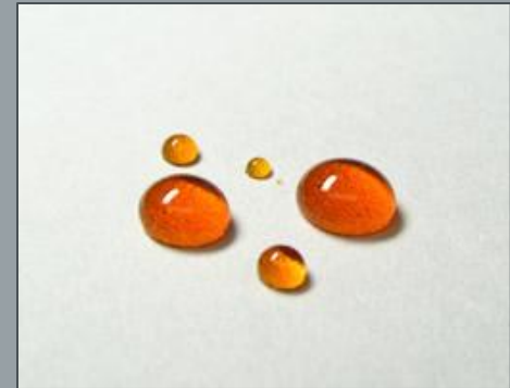
On paper food containers